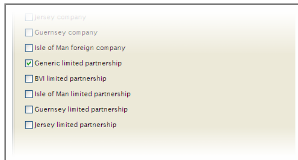
Figure 1: The new limited partnership options on the Extensions page of the Client form

The Option Pack adds two or more client extensions – the generic limited partnership extension and at least one jurisdictional limited partnership extension – to Jobstream’s Client Database.